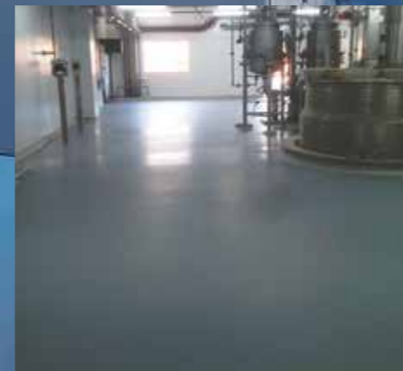
Parsons Nutricional, (Mondalez) Bangalore, India Nitoflor SL3000 UT, Nitoflor TF10000 & Nitoflor FC150 500m 2 , July 2015