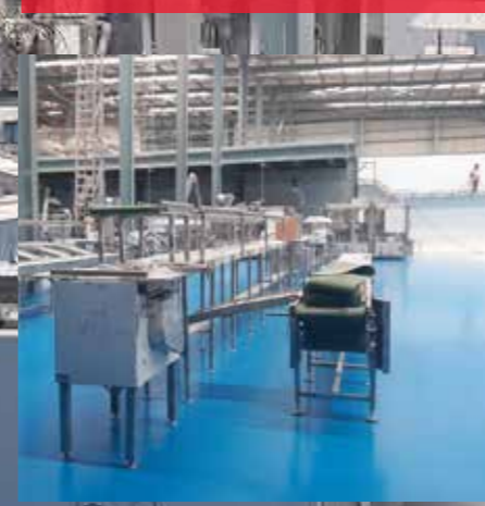
Allied Breweries Hyderabad, India Bottling & Packing Halls Nitoflor SL3000 UT in RAL5012 6,200m 2 , May 2017