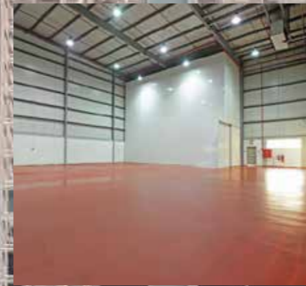
Nadia Dates Jeddah, KSA Production & packing area floors Nitoflor SL3000 UT in red 700m 2 , Sept 2015